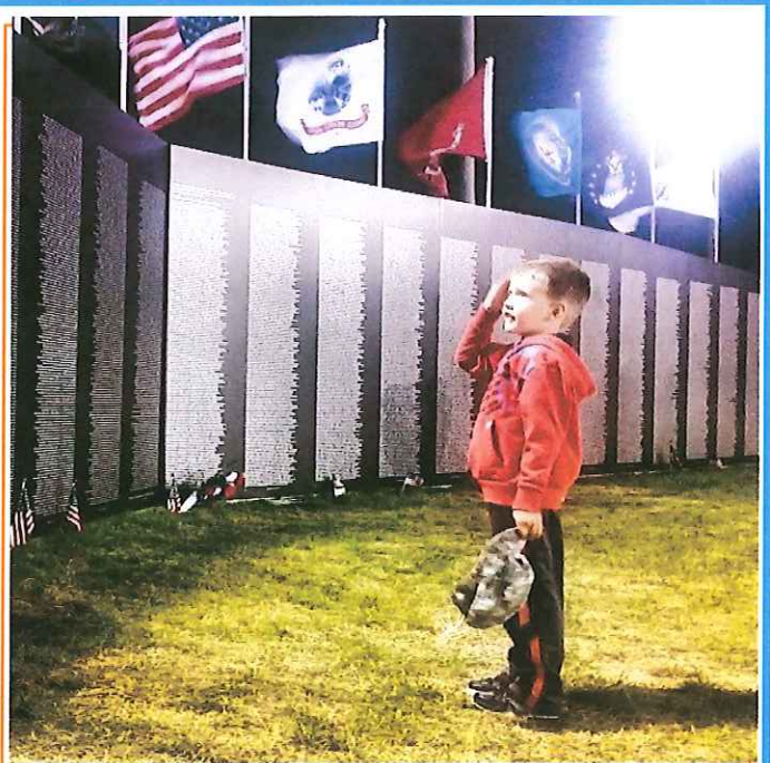
A young boy pays tribute at the Memorial Wall when it passed through Imperial.